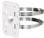
PFA152 Pole mount