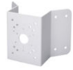
PFA151 Corner Mount