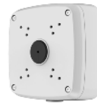
PFA121 Junction box