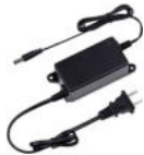
DC12V/2A Power Adapter